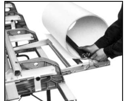
Changes coils quickly. Coil capacity up to 24" wide and 150' long.