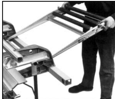
Lightweight and easy to use. Weighs less than 10 lbs. Hooks on to your Brake in seconds.

The portable coil holder that becomes an integral part of your "Windy" SP Port-O-Brake to increase your production and help eliminate waste.