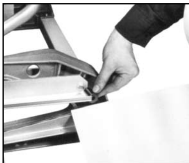
Plastic Coil Guards provided. Install as indicated. Protects Coil from marring.