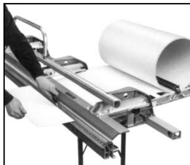
Fast, simple one-man operation. Roll out and cut squarely to your exact length.