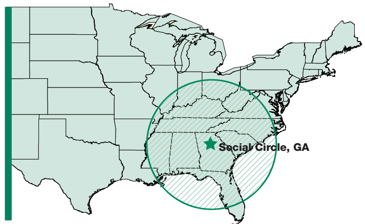
Installing Restoration Millwork® Trim on projects located within 500 miles of our Social Circle, GA, plant can earn LEED points for regional and local materials.