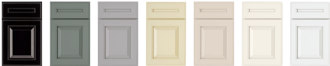
Onyx Slate River Rock Vanilla Cream Latte Linen Alpine White