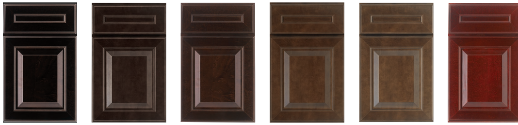
Double Espresso Truffle Espresso Autumn Brown Nutmeg Bordeaux