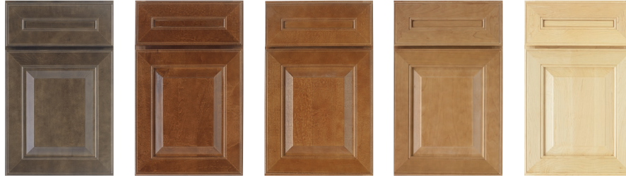
Storm Mocha Café Toffee Crystal