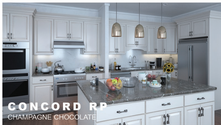
CONCORD RP CHAMPAGNE CHOCOLATE

Dover's ever popular Shaker style has a timeless appeal for any home's decor. Its minimalistic design features transitional styling that can enhance any look from traditional to contemporary.