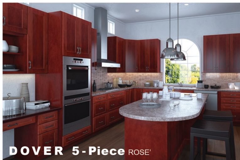
DOVER 5-Piece ROSE'

Americana Capital Series is a wonderful way to enhance any room in your home. With a little imagination you can transform a bath, kitchen, or laundry room into a space that is uniquely yours.