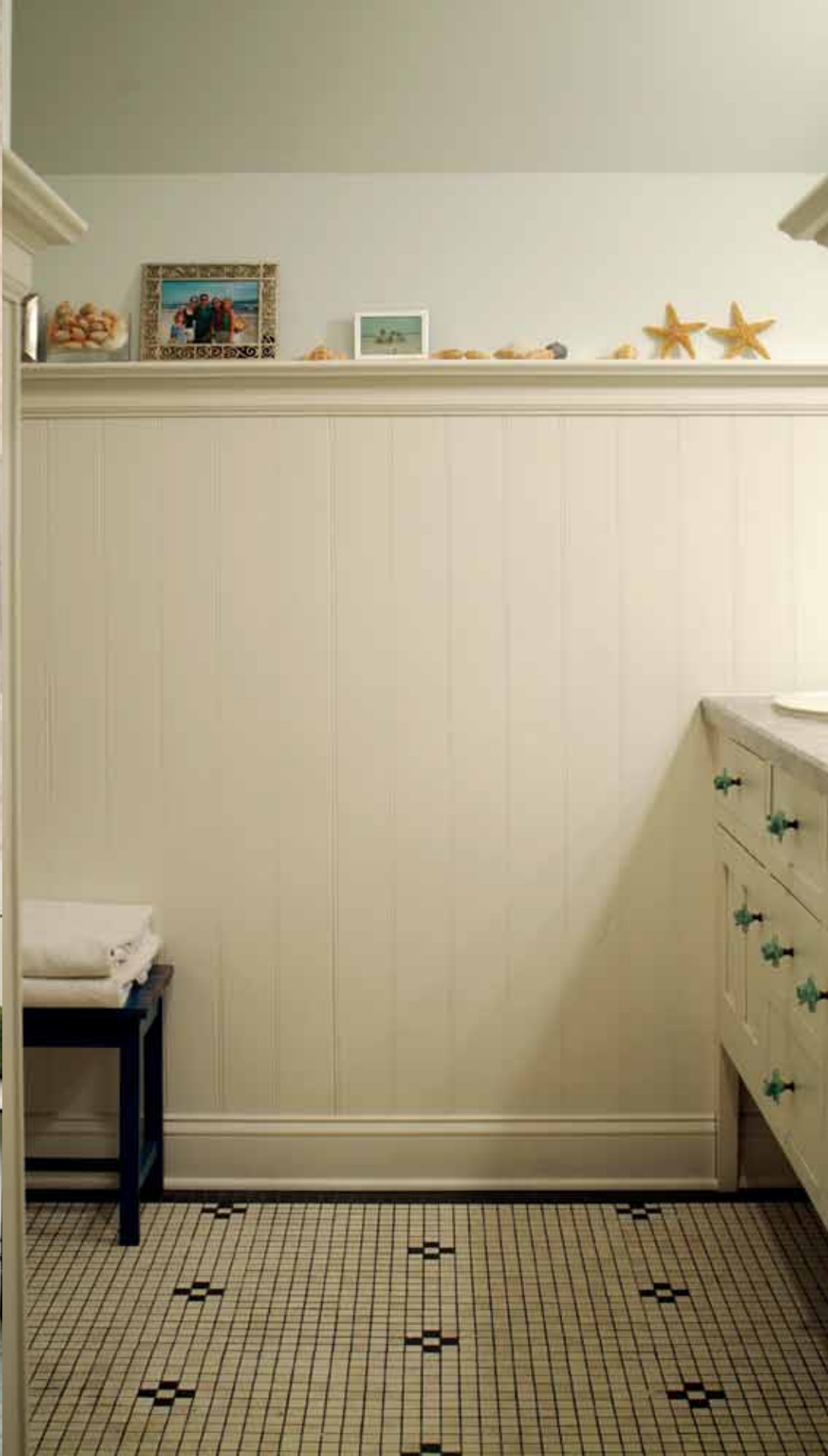
The American Pacific view of paneling includes a 4" Beadboard shown at left, Cottage Board and Batten Panels as a Wainscot and Ivory Elements Designer Panel on top in the center and 4" Beadboard with Moldings and Shelf on right. Visit AmericanPac.com for a more information.