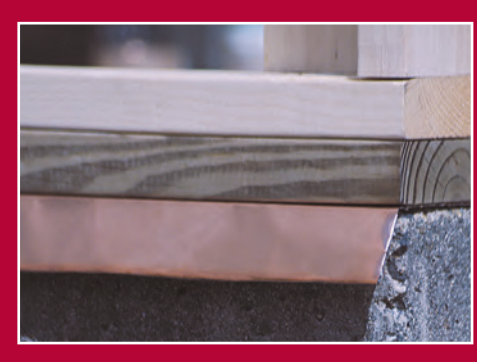
YorkShield 106 TS copper flashing won't corrode with ACQ treatment