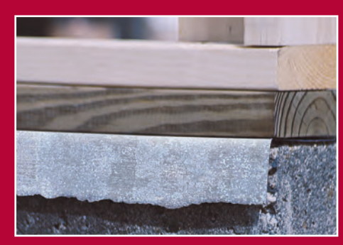
ACQ treatment corrodes aluminum flashing

Since January 1, 2004, the EPA has mandated that pressure-treated lumber be arsenic-free. But the ACQ treatment replacing arsenic-based chemical preservatives contains a higher level of copper... causing a galvanic reaction that will corrode, degrade, and destabilize the integrity of aluminum flashing. That's why you need YorkShield 106 TS.™