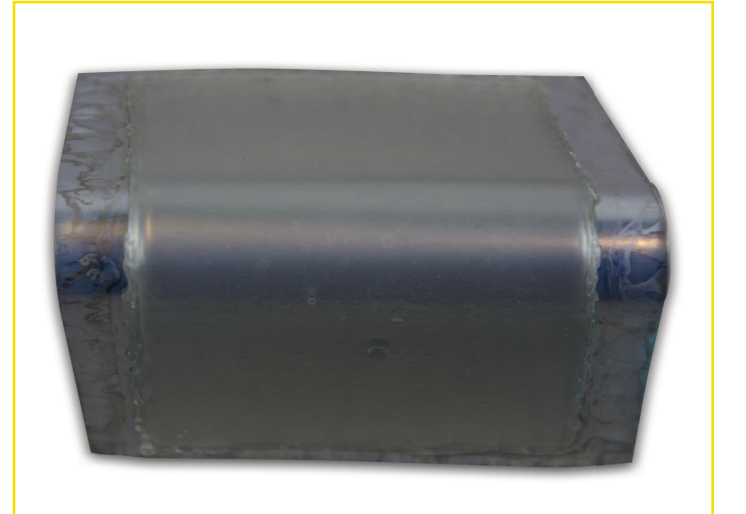
Through the Roof!® after 2000 hours of UV exposure. It's still clear, elastic, and adhering well. The result? A roof protected from leaks.

It's a bold claim that Sashco proved through detailed and thorough laboratory testing. In fact, not only did we prove that Through the Roof!® lasts a minimum of 20 times longer, we observed that the asphalt products start failing after just 100 hours of exposure— that's a mere 14 days!